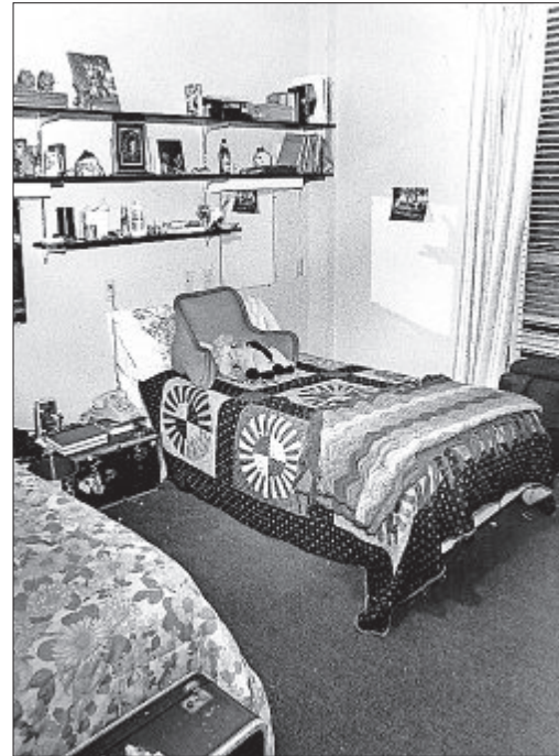
A dorm room in 1973.