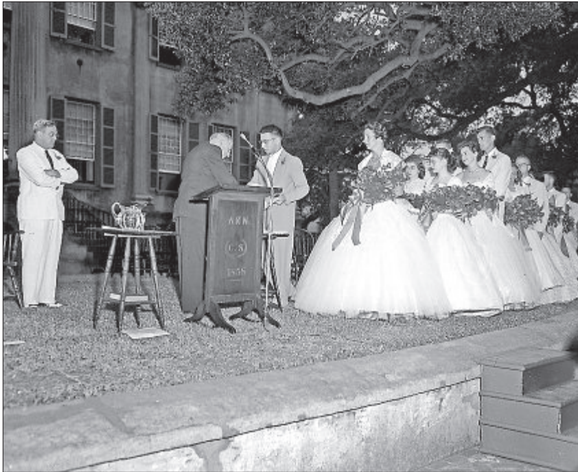
Students graduate from the College of Charleston on May 29, 1956.